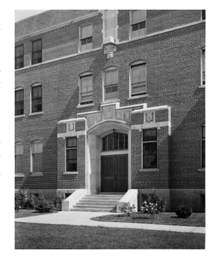
The red brick Salzmann Hall at still exists on Kinnickinnic Ave.