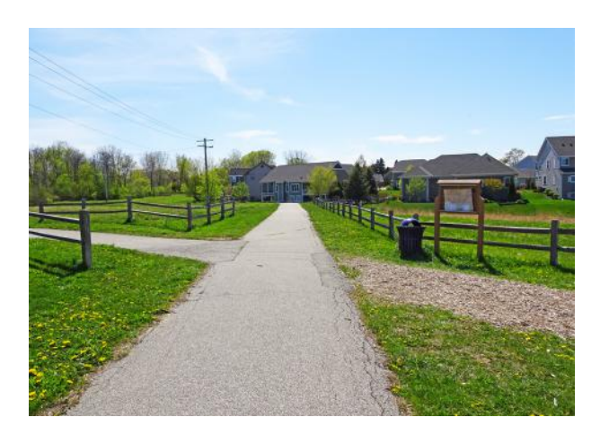
Above, a map of the trail

Bottom, a paved pathway that runs through Nojoshing Trail