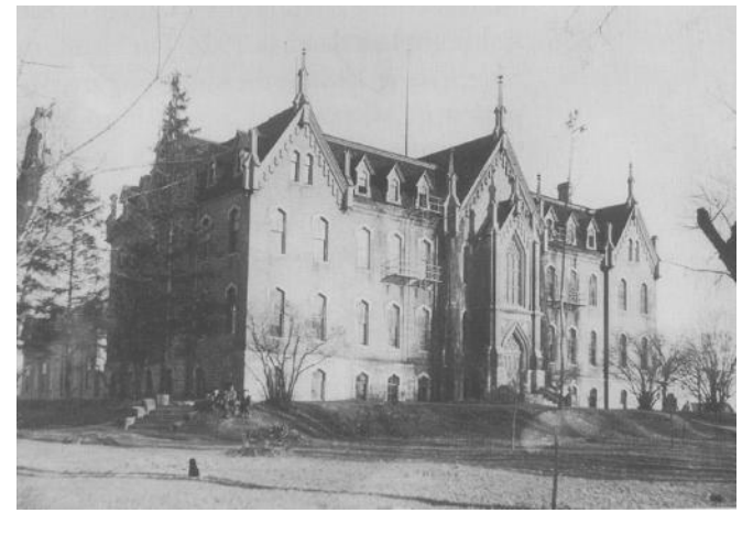
Holy Famiy & Pio Nono College at the present site of St. Thomas More High School. It was razed in around 1930.

In 1965, Salzmann Hall, facing Kinnickinnic Avenue, was reopened as Pio Nono High School, and a new building was added to the rear of Salzmann Hall in 1968. In 1972, Pio Nono high school merged with Don Bosco High School, forming the present-day St. Thomas More High School. The old Salzmann Hall building is still in use by the high school.