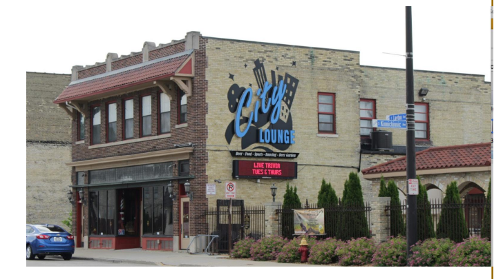
The City Lounge at 3455 E. Layton Ave. Cudahy

Eastbound Lounge and Nightclub reopens. There are some strange late evening occurrences that start happening. The Eastbound Lounge owners, at this time a husband and wife couple, have closed the bar one night and the wife was alone in the barroom counting the day's receipts at the cash register. She sensed a feeling that there was someone watching her. She knew that she was the only one there. She dismissed this feeling and continued counting. Suddenly she felt is a hand on her shoulder and she quickly turned around to find no one was there. Her husband had a similar situation. He recalled that one time late at night, when he had been alone in the stock room taking inventory, an eerie feeling came over him and then all the bottles mysteriously started vibrating and clinking together